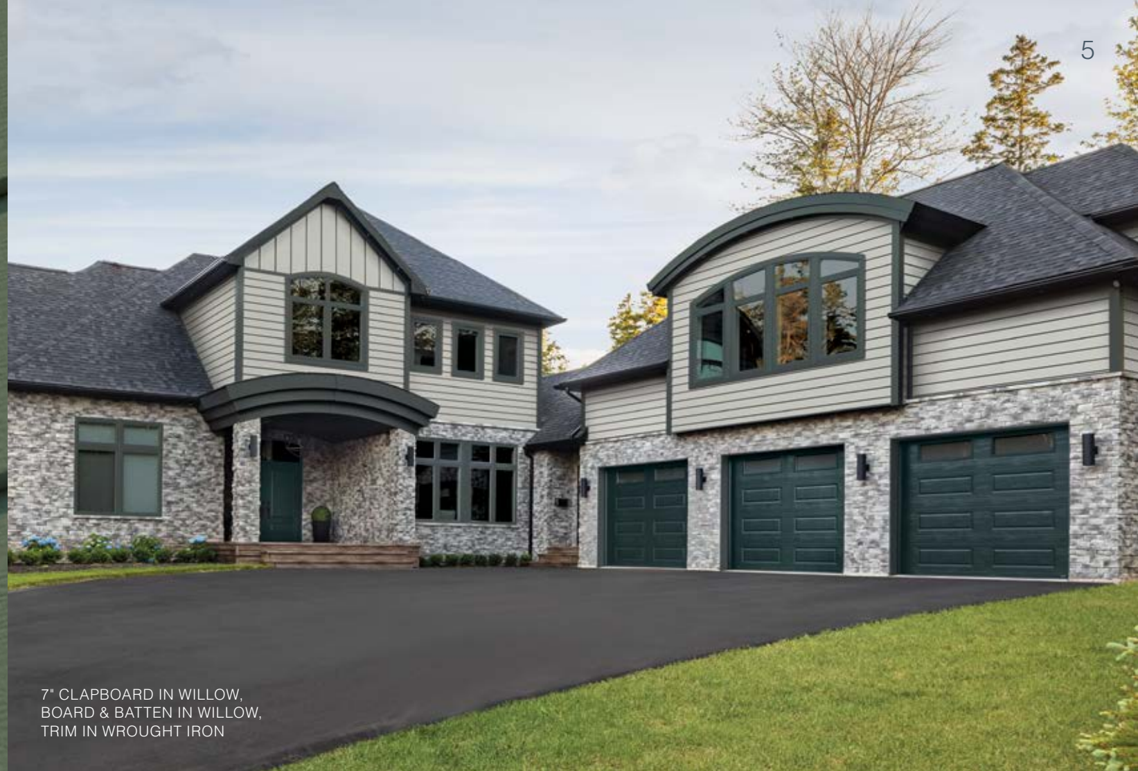
7" CLAPBOARD IN WILLOW, BOARD & BATTEN IN WILLOW, TRIM IN WROUGHT IRON