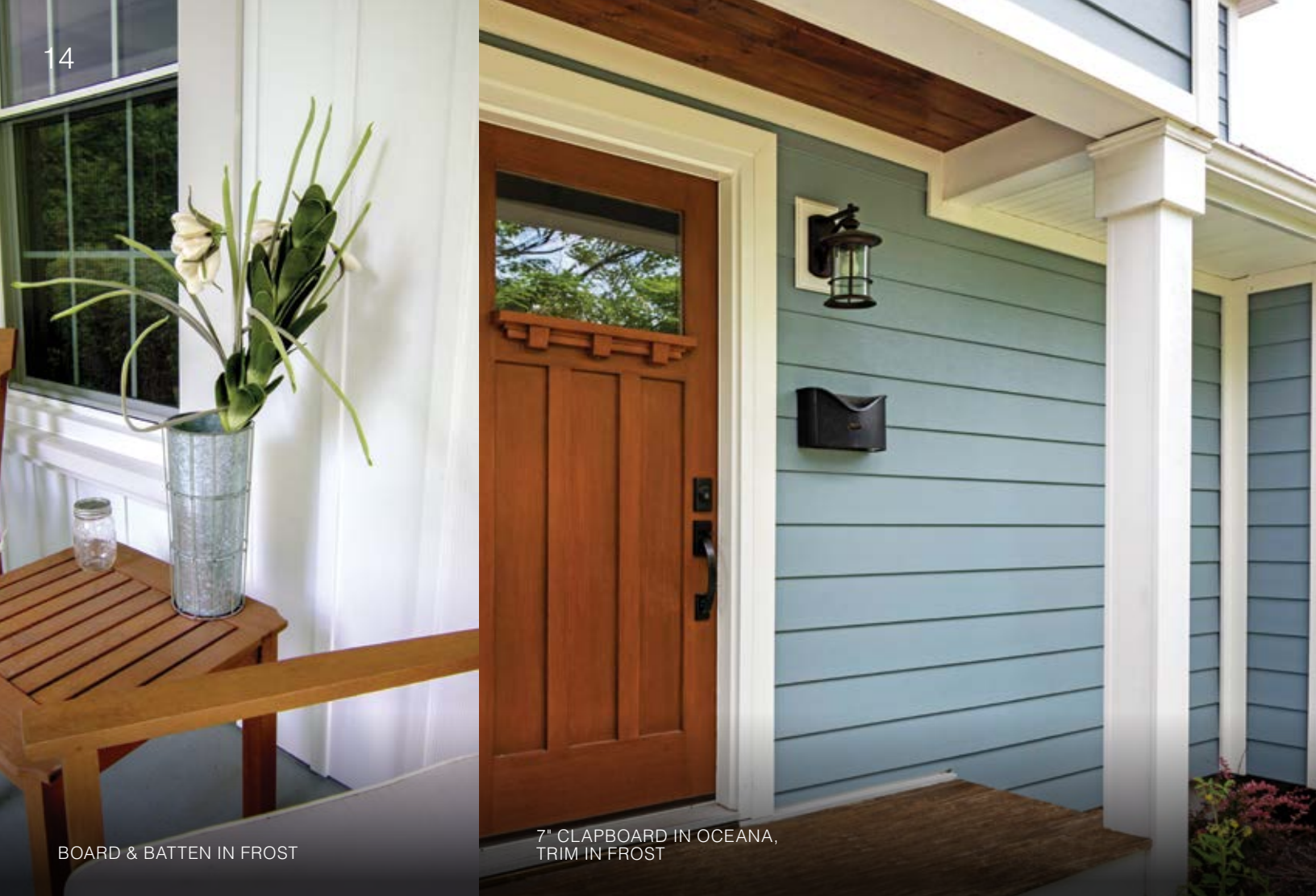
BOARD &amp; BATTEN IN FROST