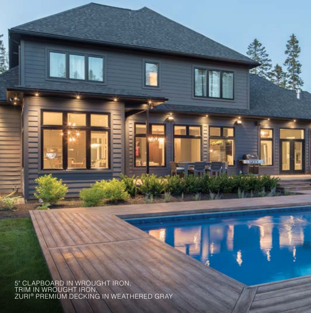
5" CLAPBOARD IN WROUGHT IRON, TRIM IN WROUGHT IRON, ZURI® PREMIUM DECKING IN WEATHERED GRAY