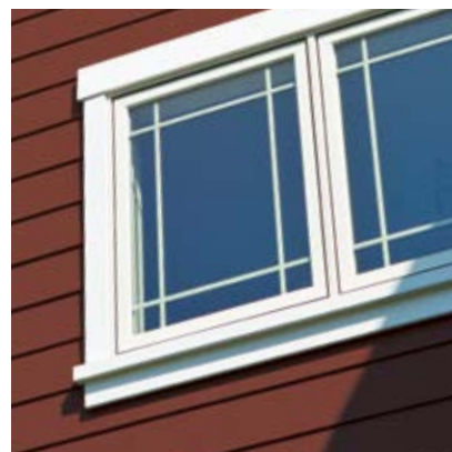
Window surrounds complete the curb-appealing picture.

They come in the same fade-resistant Kynar Aquatec®-coated color palette as Select Siding. So they complement each other perfectly and have the same high aesthetic and low maintenance benefits.