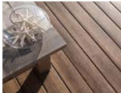
ZURI® PREMIUM DECKING