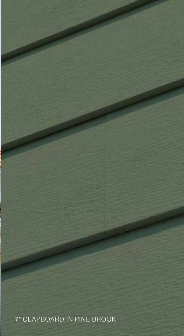
7" CLAPBOARD IN PINE BROOK