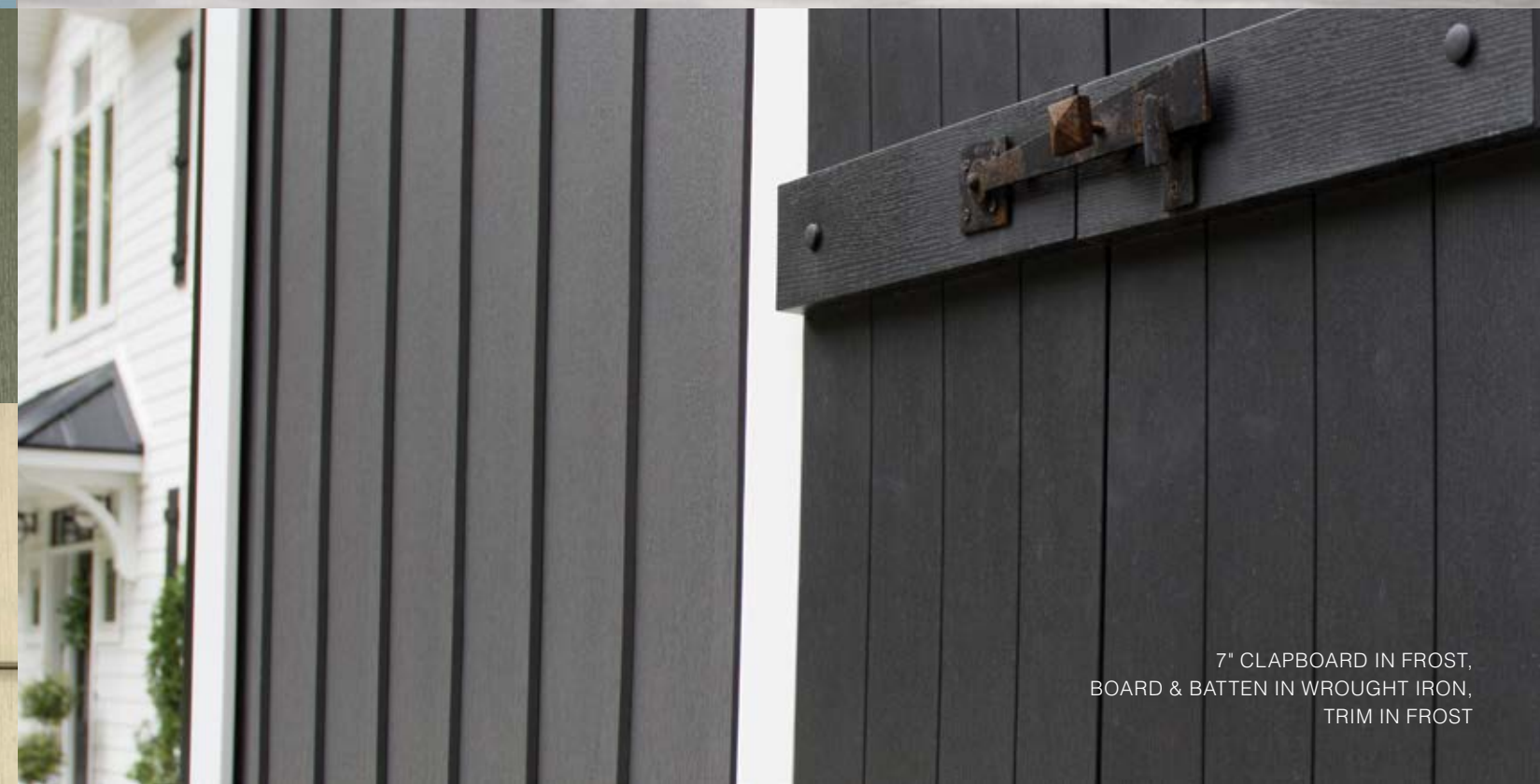
7" CLAPBOARD IN FROST, BOARD & BATTEN IN WROUGHT IRON, TRIM IN FROST