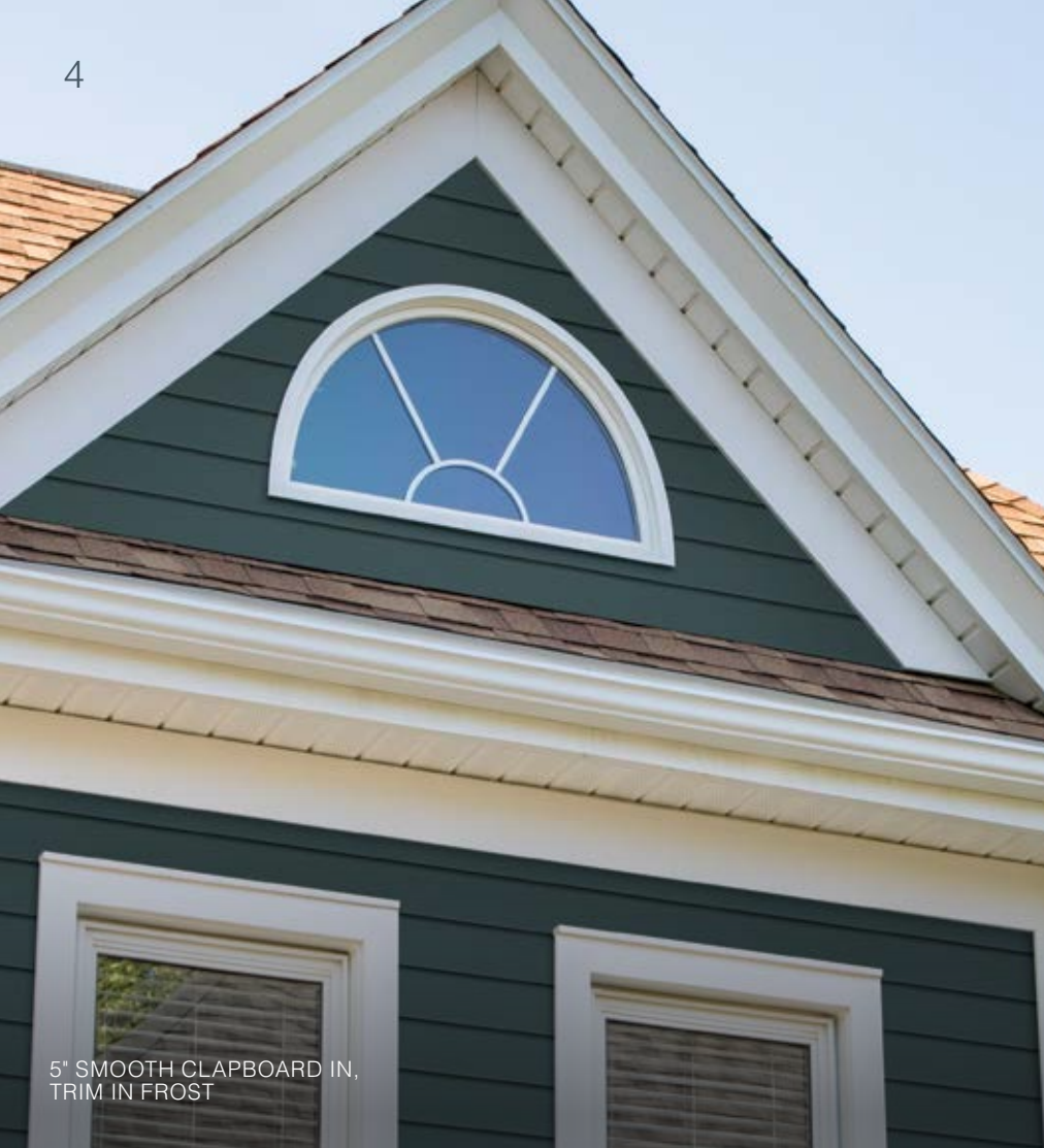
5" SMOOTH CLAPBOARD IN, TRIM IN FROST