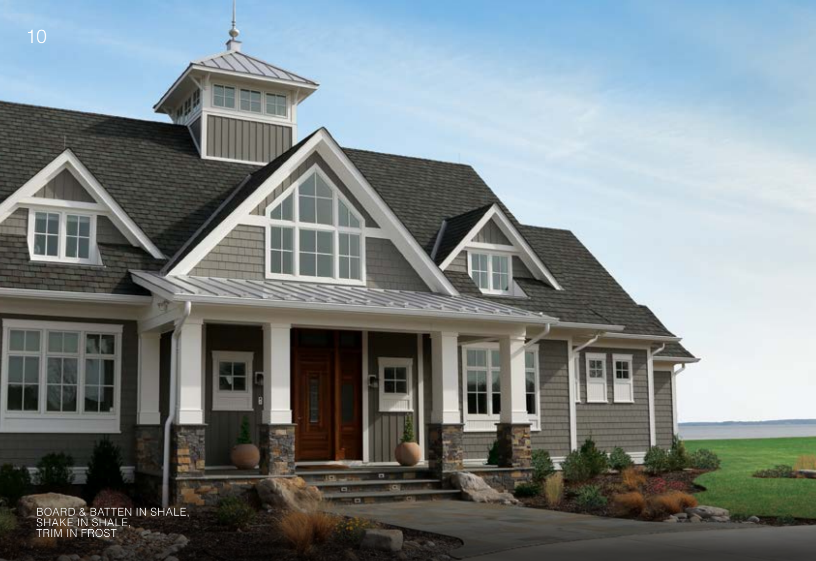
BOARD & BATTEN IN SHALE, SHAKE IN SHALE, TRIM IN FROST