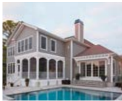
CELECT® CELLULAR COMPOSITE SIDING