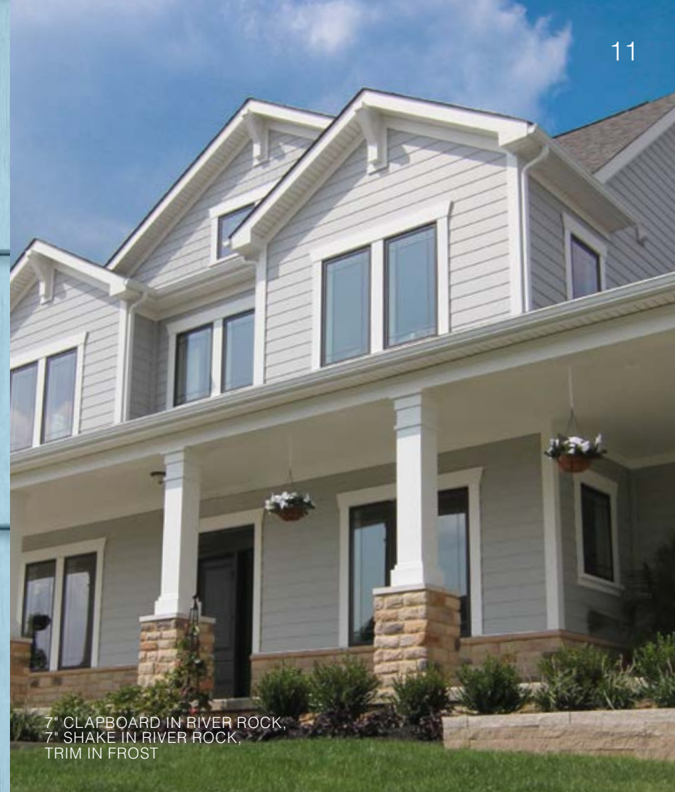
7" CLAPBOARD IN RIVER ROCK, 7" SHAKE IN RIVER ROCK, TRIM IN FROST