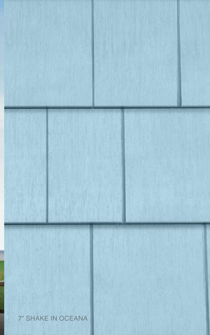
7" SHAKE IN OCEANA