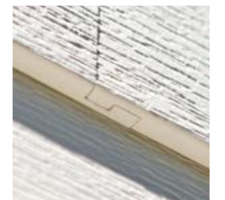
Our patented interlocking joints eliminate gaps, buckling, wavy lines, caulked seams and energy loss.