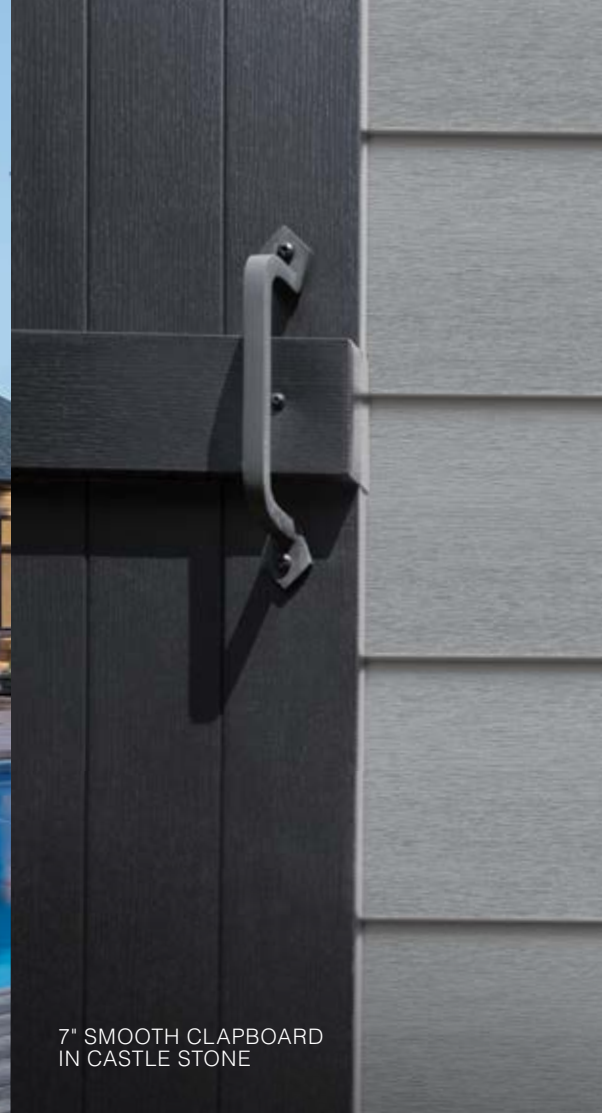
7" SMOOTH CLAPBOARD IN CASTLE STONE