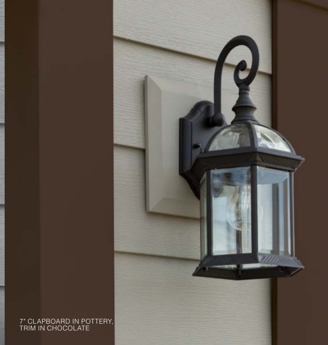
7" CLAPBOARD IN POTTERY, TRIM IN CHOCOLATE